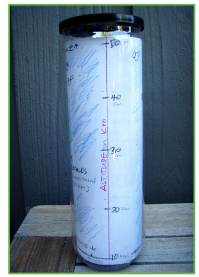
-Back of tube