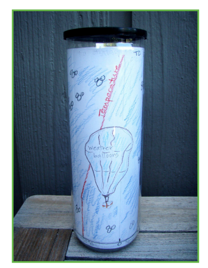
This is a diagram of the stratosphere - Front of tube.

Atmosphere Layer Chart on next page. Insert and Atmosphere chart- on page 133-34.