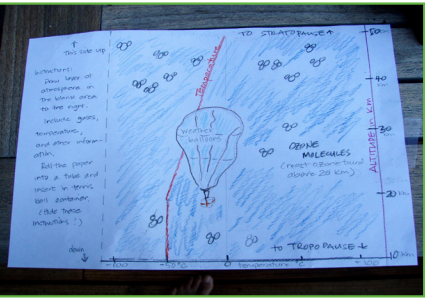
Above: Diagram drawn out before rolling and inserting in tube.

(NOTE: Though the cylinders are all of equal height, the layers they represent are of differing thicknesses. If you want to build a model of the atmosphere to the correct vertical scale, you will need to calculate the height of each layer as a percentage of your total column height).